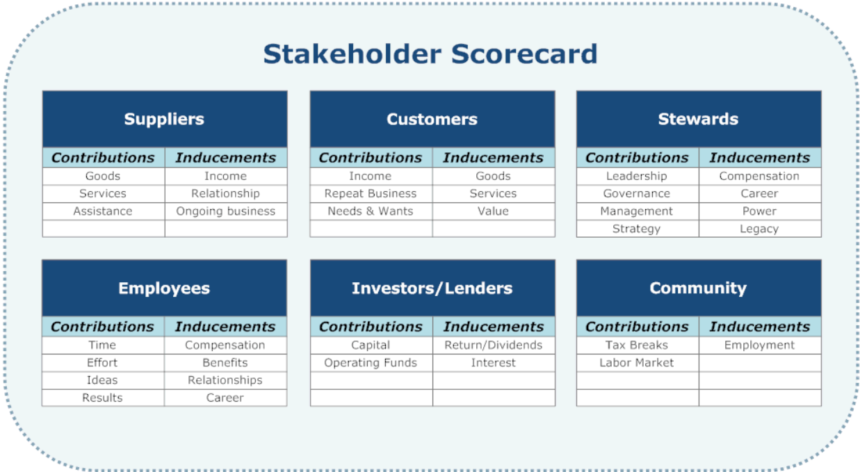
Figure 1 - An Illustrative Stakeholder Scorecard

My central point in this paper is that many organizations would be well served by making use of scorecards reflecting the mutual accountability that exists between an organization and its stakeholders. Such scorecards are known as "Stakeholder Scorecards." My current view of what such a scorecard might look like for the typical business organization is shown below.