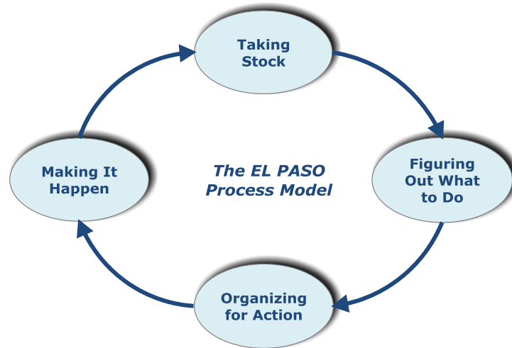
Figure 2 - The EL PASO Process Model

The something to be changed is always somewhere in the structure of the situation in which the problem can be said to be embedded. Hence, the surest, quickest route to the solution of any complex problem lies in mapping the structure of the situation in which the problem is embedded and then analyzing that structure to determine what has to change and in what ways to produce the desired results. (This kind of analysis also helps prevent what are often called “unintended side effects.”) The rest centers on the selection and deployment of means; in a word, intervention.